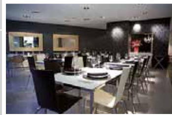
Works of reform and adequacy of place for restaurant in C/ Fernando Tirado, 6. Seville Promotor: La Oriental