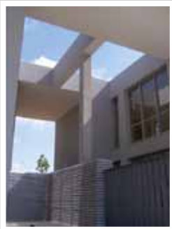
Work of new building for the construction for semidetached housings. Villanueva Golf Resort. Manzana 6-7 Puerto Real (Cadiz) Promotor: METROVACESA