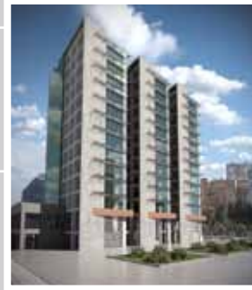
Previous studies for offices towers in ARI-DS-03, Hytasal, SEVILLA Promotor: Galia Grupo Inmobiliario