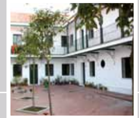
Building remodelling between party walls for dwellings in the Corral del Cura typical tenement Sevillian house on 11-13 Pages del Corro st, Seville Promotor: Gerencia Municipal de Urbanismo de Sevilla