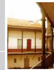
Building remodelling between party wall for dwellings, commercial premises, garages and warehouses on 29-33 Campamento Street, Seville Promotor: Casa Márquez