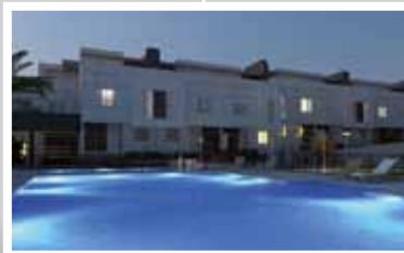
Project for one-family housings leaned In Plot F1-AO-33, Pago de Vijaldoso Promotor: Grupo Pinar