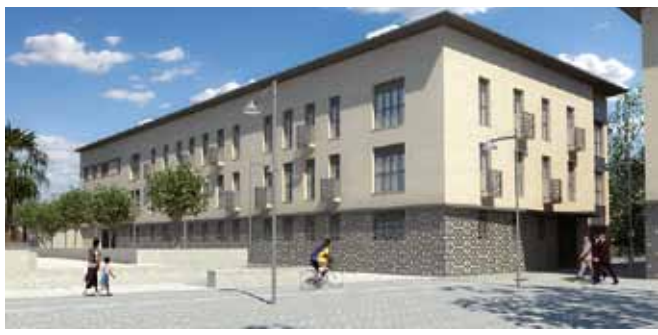
New construction building for dwellings, commercial space, garages and warehouses. U.E. TR1 Triana, Pagés del Corro street and Alfarería street, Seville Promotor: Galia Grupo Inmobiliario