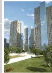
Previous studies for 4 residential towers give housings in the sector ARI-DS-03, Hytasal, Sevilla Promotor: Comarex Corporación Inmobiliaria