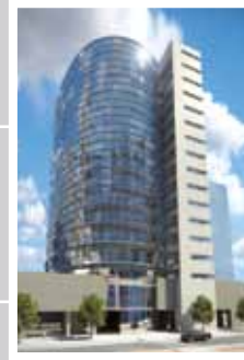
Previous studies for offices towers in ARI-DS-03, Hytasal, SEVILLA. Promotor: ACCIONA