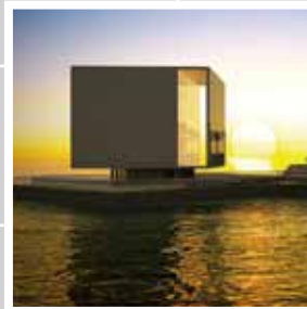
Draft ideas for multi-uses buildings. Exhibition Promotor: Feria de la Construcción "The big Five"