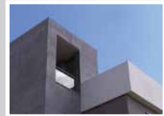
Work of new building for the construction of detached housings. Villanueva Golf Resort. Manzana 16 Puerto Real (Cadiz) Promotor: METROVACESA