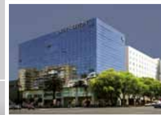
New building construction for offices, commercial premises and hotel "Galia-Nervion" Building, Luis de Morales street, Seville Promotor: Novotel